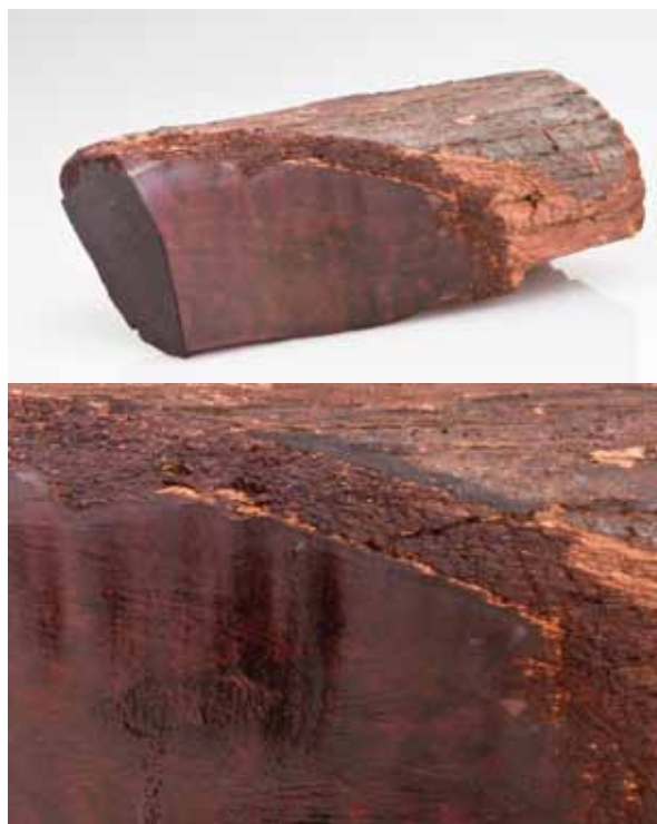
Photo 2.1. Sometimes a keen observer sees an apparently rotten stem on the forest floor, lying there for perhaps half a century or more, which upon inspection proves to be a piece of core-wood of Letterwood, hidden in a mantle of decayed sapwood. Letterwood Brosimum guianense , Moraceae, is a very durable, dense and heavy wood. Local varieties show an attractive pattern of blots. It was one of the first export products of Suriname and it was gathered by hand.

The demand for wood products was, for a substantial part, satisfied by timber imports from the USA. Sailing ships sent to Suriname to collect agricultural products carried sawn wood as ballast; that was cheaper than locally processed boards. Buildings in the old residential quarters of Paramaribo were partly constructed from American pitch-pine lumber ( Pinus palustris and P. elliottii , mainly).