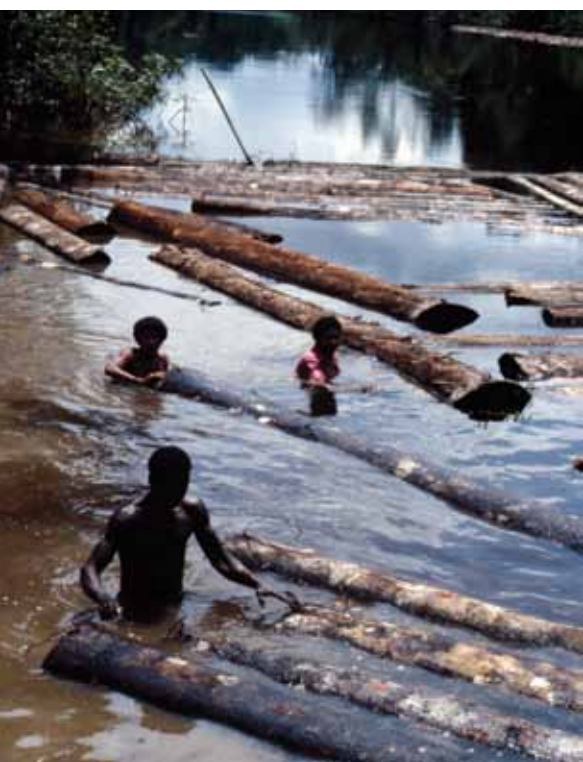
Photo 2.3. Virolo spp. (Baboen) stems are selected and combined into a raft for transport to the sawmill. Coesewijne, Suriname, 1982.

was more profitable than timber exploitation and could be done with far lower investments than those required for logging. The Balata Ordinance of 1914 included prescriptions for tree tapping and gum preparation, and stipulations to maintain the required harvesting cycle, in order to protect the bolletri from overexploitation. With the continued recession of the plantation agriculture, the balata business offered jobs to thousands of workers (“balata bleeders”) in the first two decades of the 20th century. After a peak export in 1913 the significance of the balata industry gradually declined until it ceased to exist in the early 1970s, but the bullet-tree is still protected and its restricted felling is subjected to special regulations in the Forest Management Act of 1992.