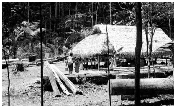
Photo 2.8. The encampment at Tonka site, near the MAIN Experiment. Such traditional huts are comparatively cool and comfortable for those accustomed to sleep in a hammock.

The Silvicultural experiments. The largest silvicultural experiment, the MAIN experiment at Kabo, aimed at determining which combination of logging intensity and silvicultural treatment would result in optimal development of the commercial stand. The scheduled silvicultural treatments were two varieties of CSS (CELOS Silvicultural System, see Chapter 3) and a control treatment, and the logging treatments were tree levels of semi-controlled selective felling. This completely factorial block experiment originally consisted of three randomized blocks (replications), each of nine treatment plots, and tree virgin plots which were added in 1981.