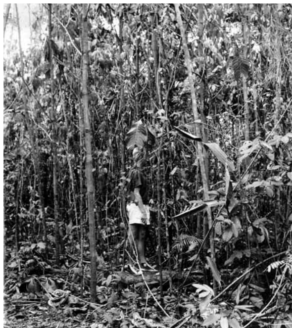
Photo 2.7. Early treatment schedules were very intensive, with stand basal area reductions from an original 28 \text{ m}^2 \cdot \text{ha}^{-1} of the logged forest to a mere 4 \text{ m}^2 \cdot \text{ha}^{-1} . Regrowth after such treatment was very dense, and several secondary species strongly dominated. The person in the bush is Dr Jan Boerboom.

New field experiments to test the monocyclic system were started by Boerboom at the field stations of the Centre of Agricultural Research