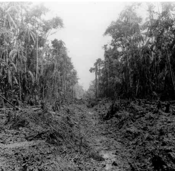
Photo 2.5. and Photo 2.6. Extensive stands of Virola surinamensis (Roland.) Warb. (Myristicaceae), in the coastal swamps were opened up by small canals. In the early days these canals were sprung with dynamite, but later they were dug out with machines.