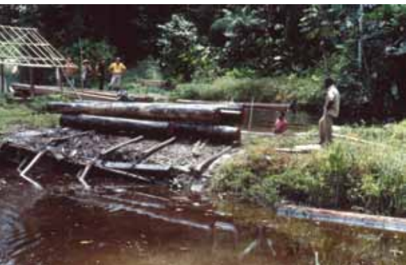
Photo 2.2. Virolo spp. (Baboen) stems are pulled over a little dam, which separates two water basins with permanent different water levels. Coesewijne, Suriname, 1982.

Already before the turn of the century the most important forest product was balata or bullet-wood gum, from the bolletri ( Manilkara bidentata ). The collecting of balata